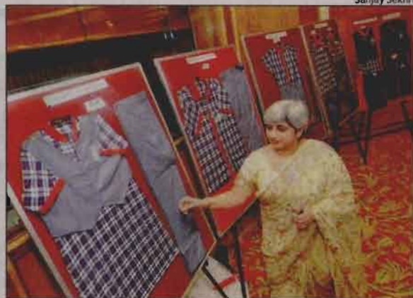
CHIC: The design-launch commemorates KVS's 50th anniversary

Turban Cotton turban for Sikh senior boys and patka for juniors